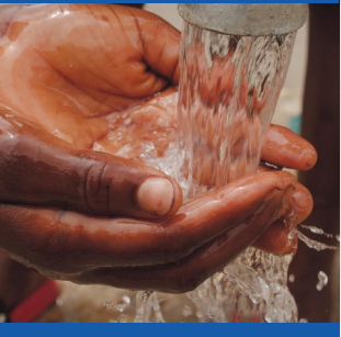
Stage 2: Go Through Deliverance and Cleansing

Denounce Matthew 12:43 "When the unclean spirit is gone out of a man, he walketh through dry places, seeking rest, and findeth none.