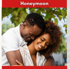
Song of Soloman 5:1 "1 am come into my garden, my sister, my spouse: 1 have gathered my myrrh with my spice: 1 have eaten my honeycomb with my honey; 1 have drunk my wine with my milk: eat, 0 friends; drink, yea, drink abundantly, 0 beloved."